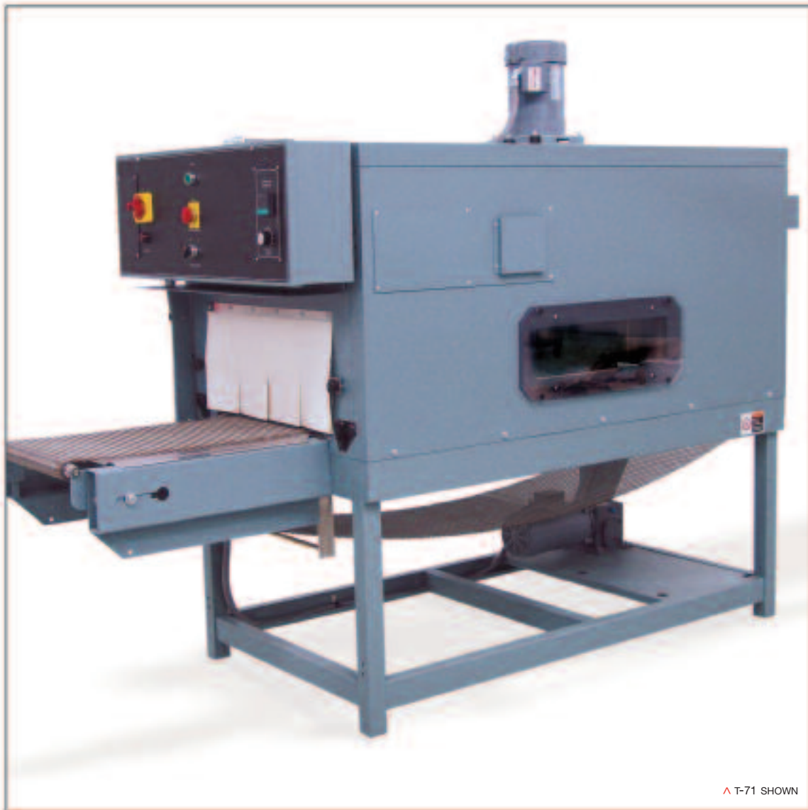
▲ T-71 SHOWN

A High Speed Performer Engineered for Your Most Demanding Applications